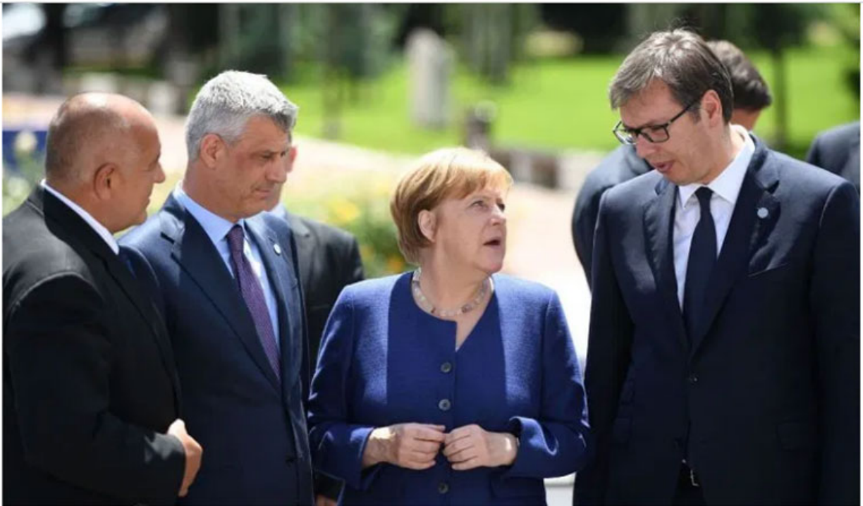
German Chancellor Angela Merkel speaks with Bulgarian Prime Minister Boyko Borisov, Serbian President Aleksandar Vucic, and Kosovar President Hashim Thaci during a summit on the Balkans in Sofia, Bulgaria, on May 17, 2018.